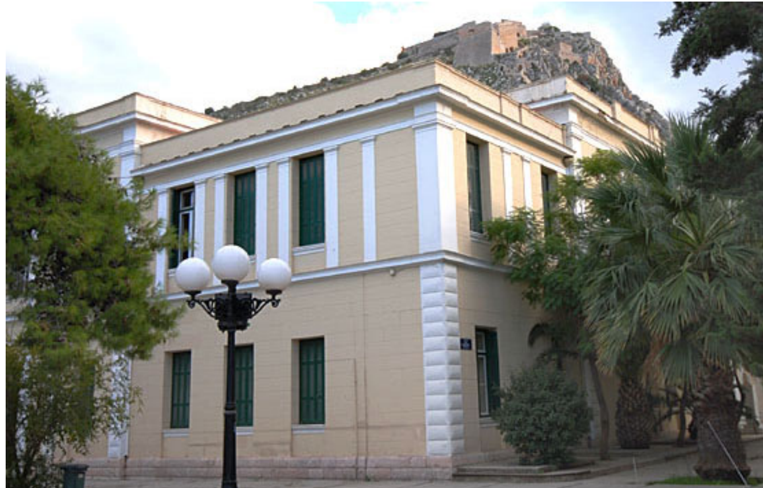
The exact location of the Magurthouse can be found in Section