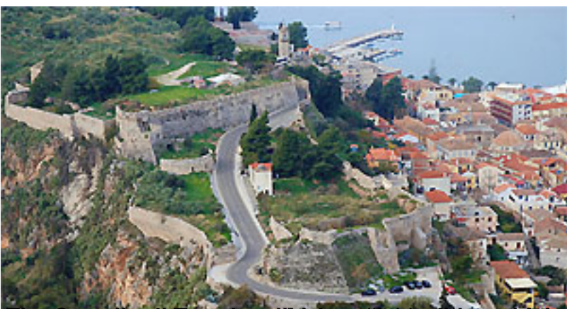
The Castello di Toro is still intercommunities under another fethelicith and emerged dati review inter

Written by Administrator Monday, 31 January 2011 10:29 - Last Updated Friday, 30 November 2012 18:49