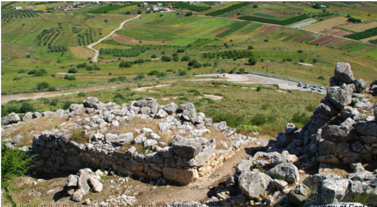
View of East Gate

Monday, 31 January 2011 10:29 - Last Updated Monday, 31 March 2014 17:41