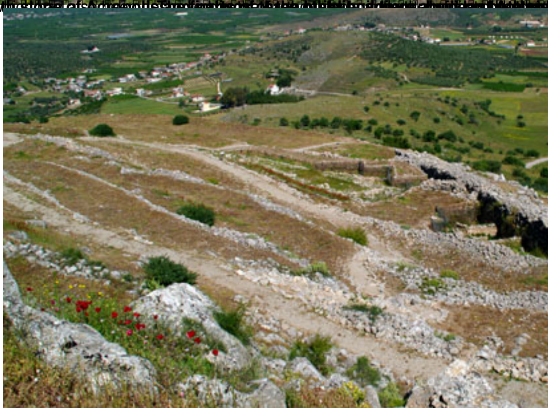
On the terrace in the south of the Mycenaean Acropolis of Midea