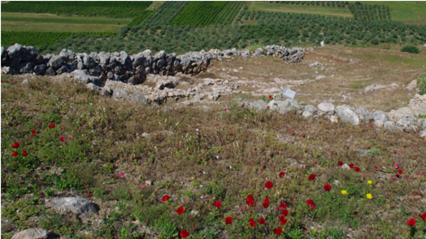
At the terrace in the south of the Mycenaean Acropolis of Midea

Monday, 31 January 2011 10:29 - Last Updated Monday, 31 March 2014 17:41